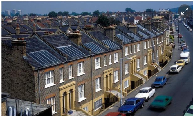
Solar panels on residential houses in East Dulwich, Southwark, South London.

London mayor's warning of the threat of proposed Tory cuts to jobs and future investment is welcomed by green politicians and industry leaders